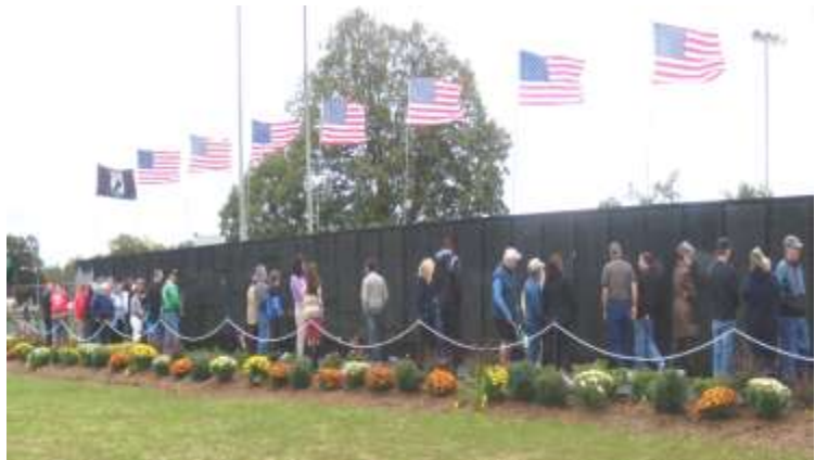
Dignity Memorial Wall Last October in Peter Nelson Park

To Volunteer or for further information, please call 631-261-4400, ext. 2991