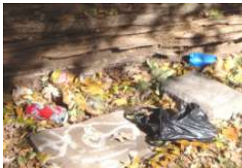
Litter, Beer Cans and the Graffiti-marred Remains of Grave Markers